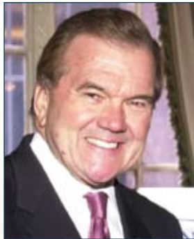
May 19, 2010 Gov. Tom Ridge, former Governor of Pennsylvania and Homeland Security Secretary, 2003-2005

Delivering the Sight Lecture for 2010, Governor Ridge devoted his remarks to the topic of risk management and specifically the need for the US to adopt a risk management mindset. "One of the philosophies we applied within the Department of Homeland Security on a day-to-day basis - and I was proud of it - was you have to manage risk, you cannot eliminate it," he said. We are living in a world that more and more is moving toward managed risk, but the US still hesitates. "We have the technical capability in this country to do it. We don't have the will," he concluded.